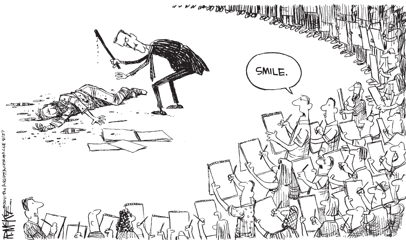
IN AN EFFORT TO STIFLE DISSENT, SYRIAN GOVERNMENT THUGS KIDNAP, BEAT UP AND BREAK ONE CARTOONIST'S HANDS,

Is that a tough line for parents to walk? Maybe. But it's worth getting it right, for children's success and happiness.